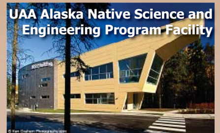
UAA Alaska Native Science and Engineering Program Facility

Collaboration...Vision...Understanding. This is the approach Davis Constructors brings to all our projects. We achieve this important balance by working with our clients in an open, collaborative process. A process that is about the owner's vision, not ours. A process built upon understanding the user's needs. A process that delivers effective construction and design-build solutions.