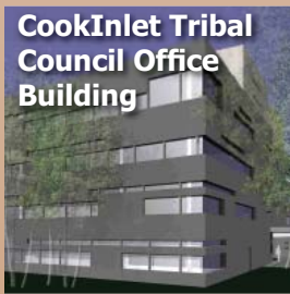
CookInlet Tribal Council Office Building

We're one of Alaska's oldest statewide general contractors. We've completed more than 200 unique projects worth almost $1 billion, covering a full range of construction material and methods, from cast-in-place concrete and structural steel to pre-cast concrete panels and wood frame structures.