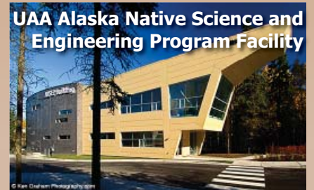
UAA Alaska Native Science and Engineering Program Facility

Collaboration...Vision...Understanding. This is the approach Davis Constructors brings to all our projects. We achieve this important balance by working with our clients in an open, collaborative process. A process that is about the owner's vision, not ours. A process built upon understanding the user's needs. A process that delivers effective construction and design-build solutions.