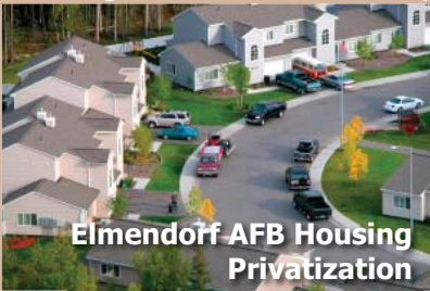
Elmendorf AFB Housing Privatization

Throughout the ups and downs of the Alaskan construction economy in the 1980's and 1990's, Davis successfully adapted to meet the needs of these various business climates, whether the work brought us to remote areas of Alaska, incorporating very aggressive construction schedules and logistical difficulties, or meeting the new trend of design build and fast track projects. All have